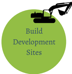
Build Development Sites

Record-setting year brought announcements of $41,071,888 in real property and personal property acquisitions and 410 new jobs projected.