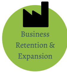
Business Retention & Expansion