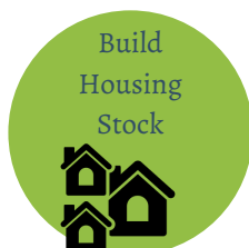
Build Housing Stock

Became an approved programmer at the Community Learning Center in preparation of the launch of a restaurant incubator program to help transition new businesses to fill downtown vacancies.