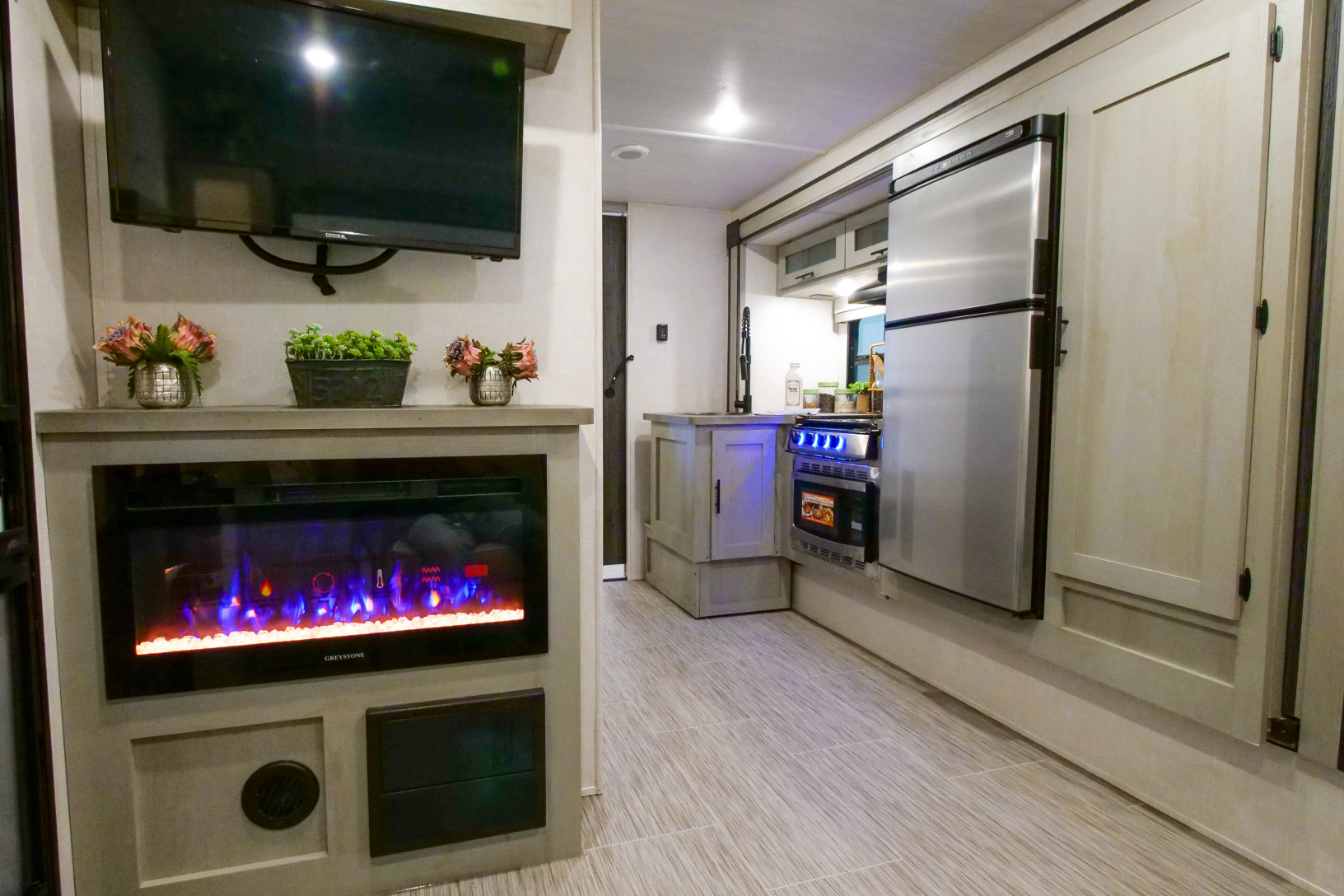
Interior of an IBEX Travel Trailer, now produced in Ligonier.