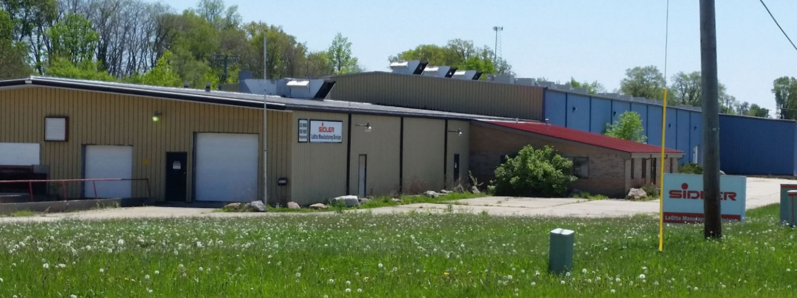
United Ortho, LaOtto. (Photo from NCEDC archive.).