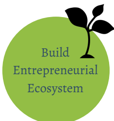
Build Entrepreneurial Ecosystem

Brought together multiple organizations to develop new Industry 4.0 lab to be housed at the Community Learning Center in Kendallville.