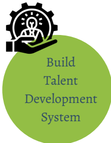
Build Talent Development System

Committed $500,000 to leverage additional funding to expand the Avilla East Industrial Park, invest in construction of 75,000 square foot industrial shell building in Kendallville, and in construction of a new road in the Ligonier Industrial Park to enhance traffic flow and accommodate industrial growth.