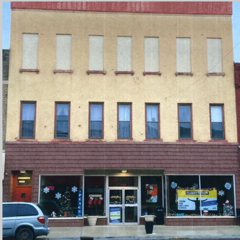
112 S Main Street, Kendallville

The Kendallville Redevelopment Commission (RDC) recommended a grant of $48,571 to fund 75% of the costs of replacing all 14 upper-level windows in the historic building at 112 S Main Street. Inspiration Ministries, the applicant, opted to take advantage of a short-term opportunity to receive an additional 25% of matching funds under the RDC's